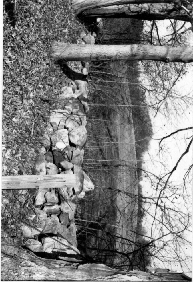
View north, Foot of Northboro Rd.