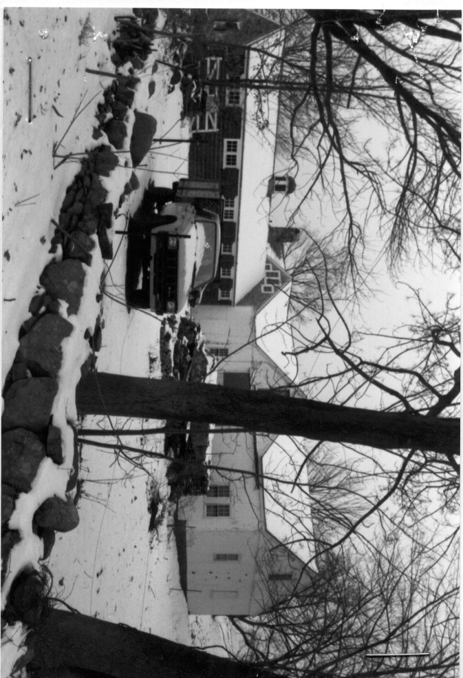
10 Chestnut Hill Rd.