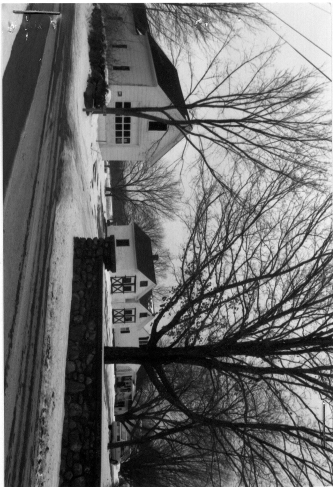
Chestnut Hill Farm