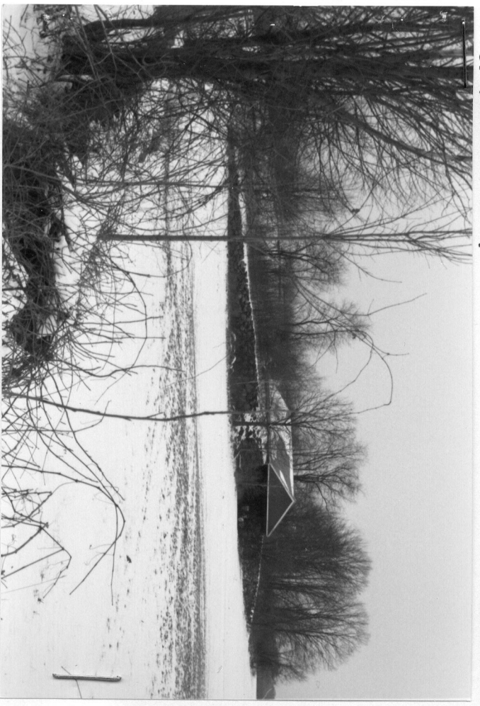
10 Chestnut Hill Rd.