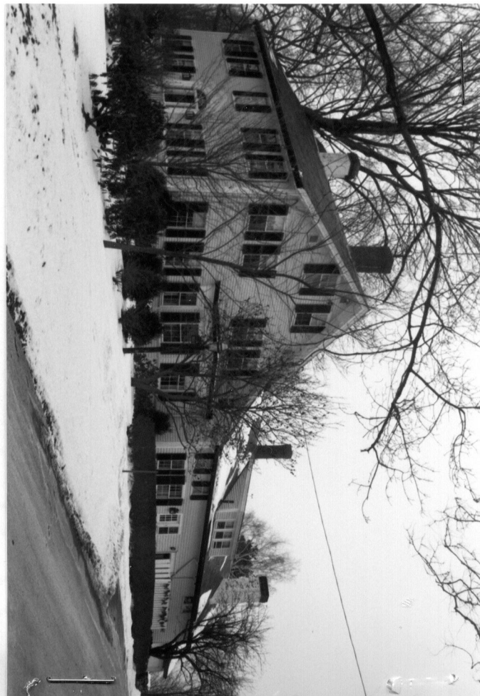
2 Chestnut Hill Rd.