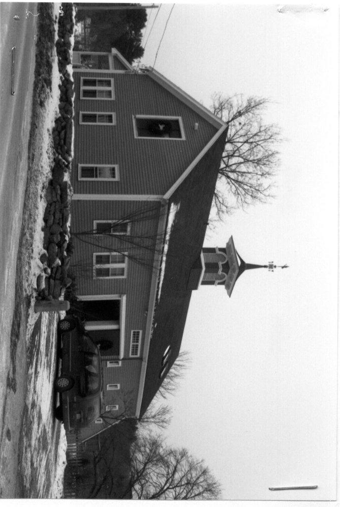
144 Main Street.