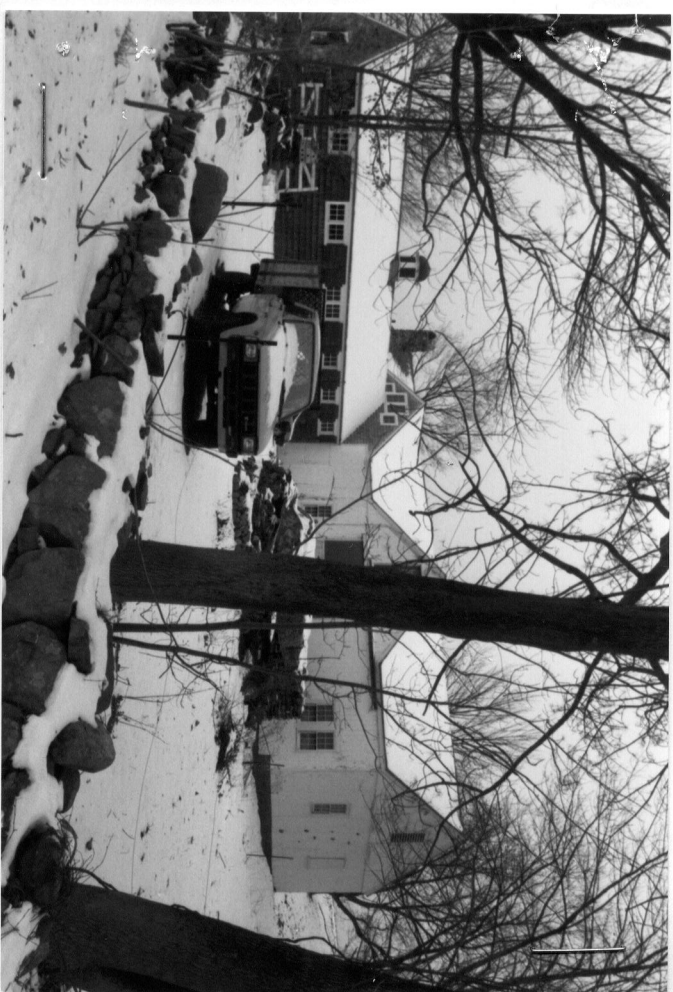
10 Chestnut Hill Rd.