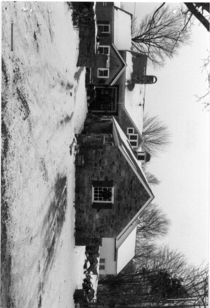
10 Chestnut Hill Rd.