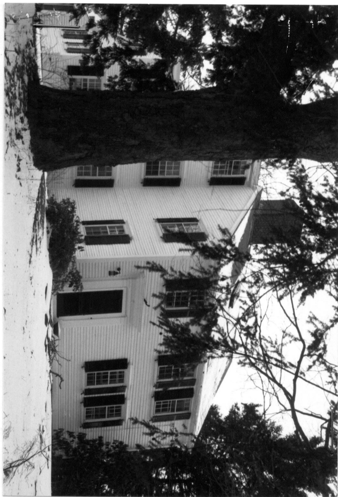
1 Chestnut Hill Rd.