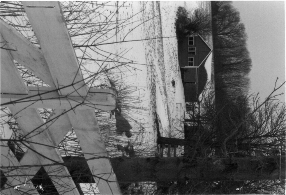
10 Chestnut Hill Rd.