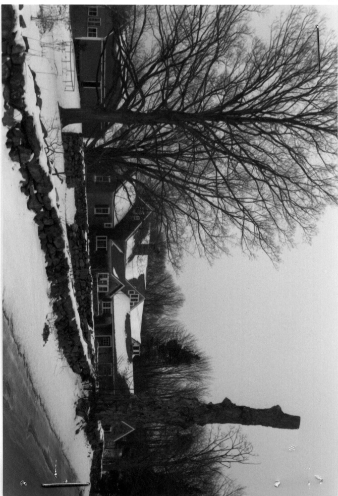
10 Chestnut Hill Rd.