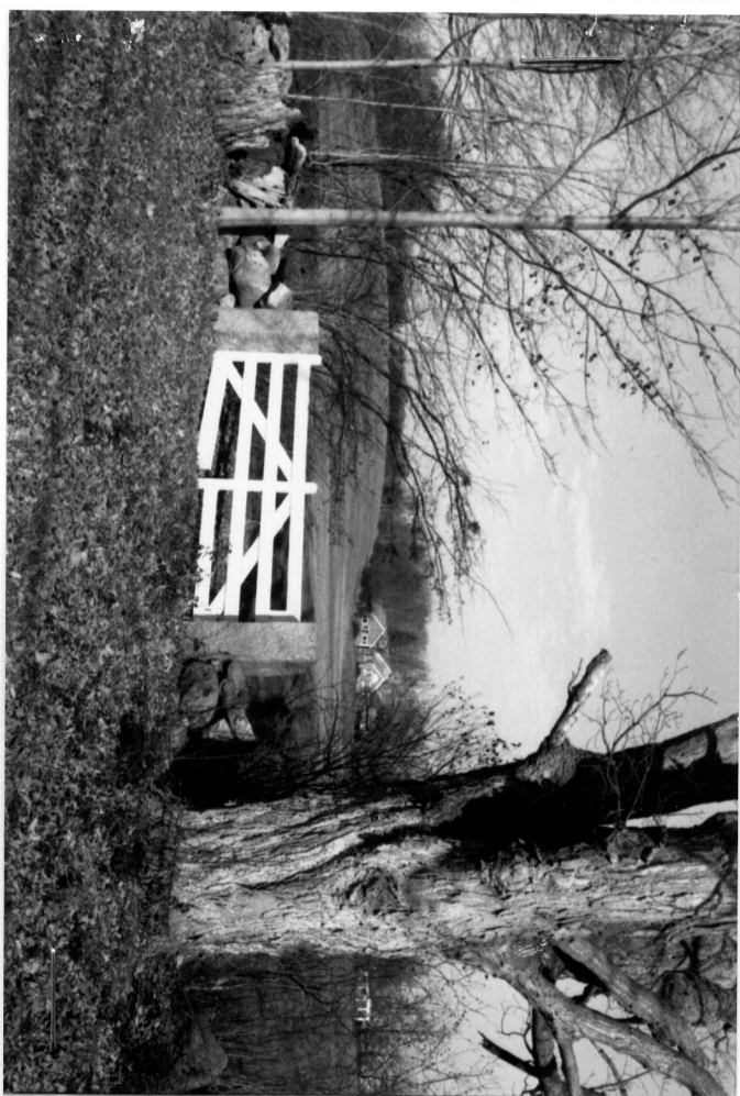
View NE, Foot of Northboro Rd.