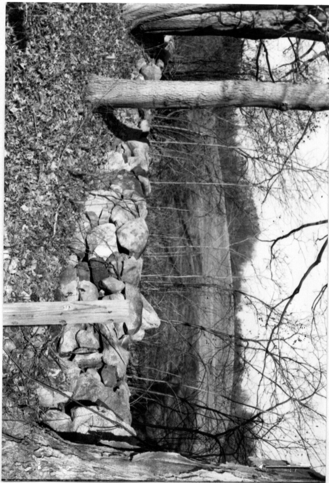
View north, Foot of Northboro Rd.