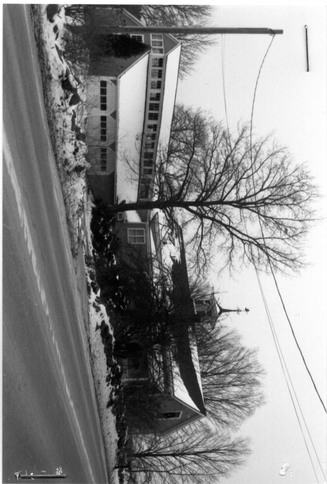
144 Main Street