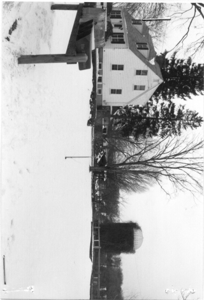
5 Chestnut Hill Rd, Chestnut Hill Farm.