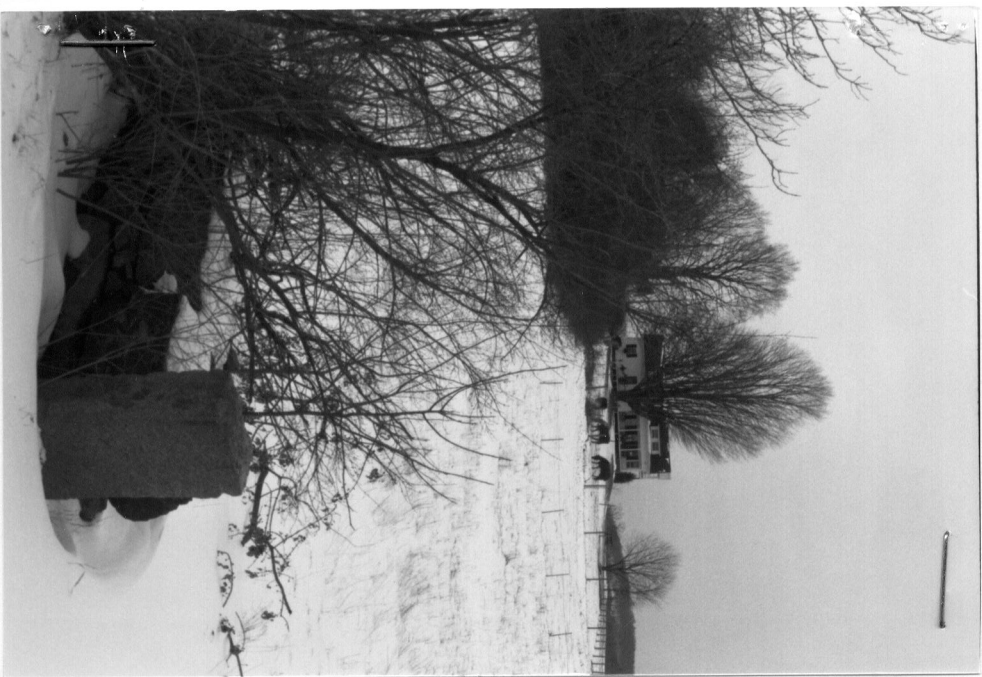
9 Chestnut Hill Rd.