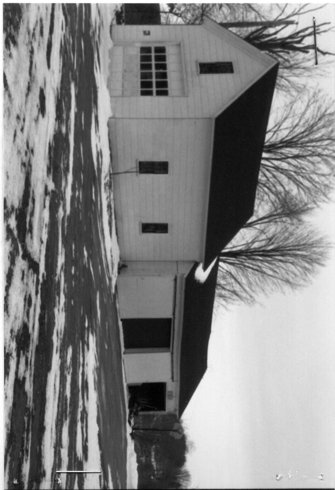
Chestnut Hill Farm