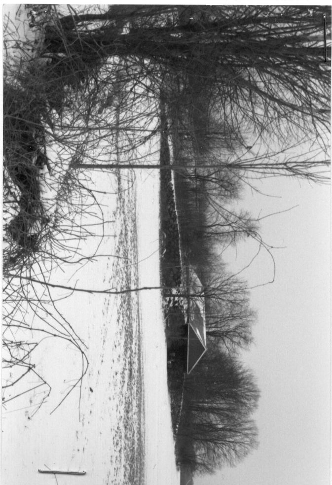
10 Chestnut Hill Rd.