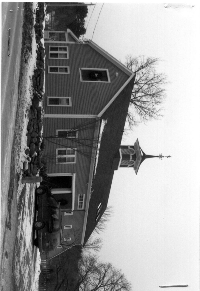
144 Main Street.