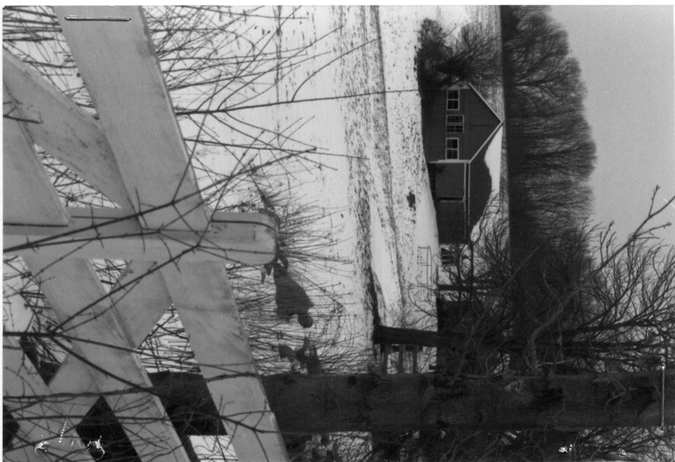
10 Chestnut Hill Rd.