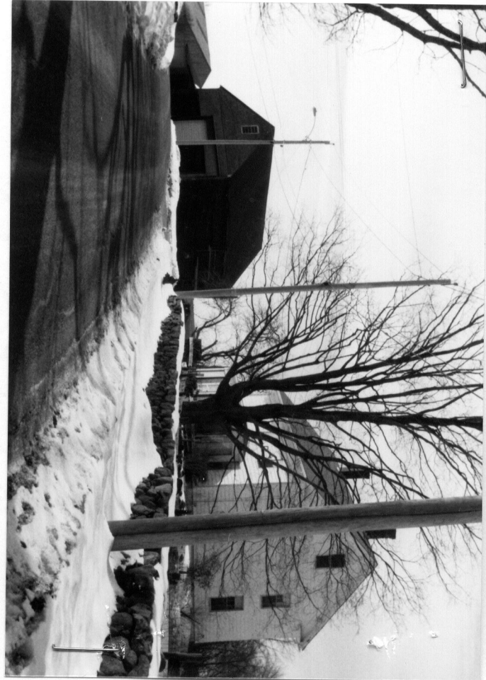
77 Deerfoot Rd.