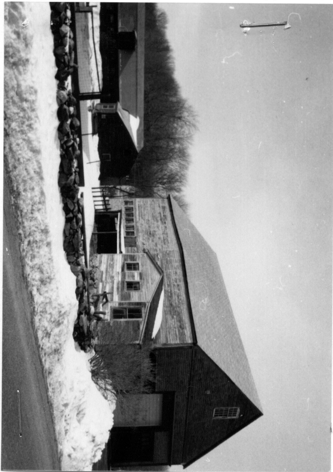
77 Deerfoot Rd - Barn