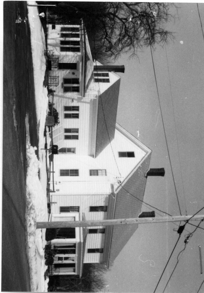
77 Deerfoot Rd.