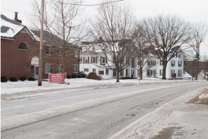
Main Street (Fay School): 50, 52, 54. View SW.