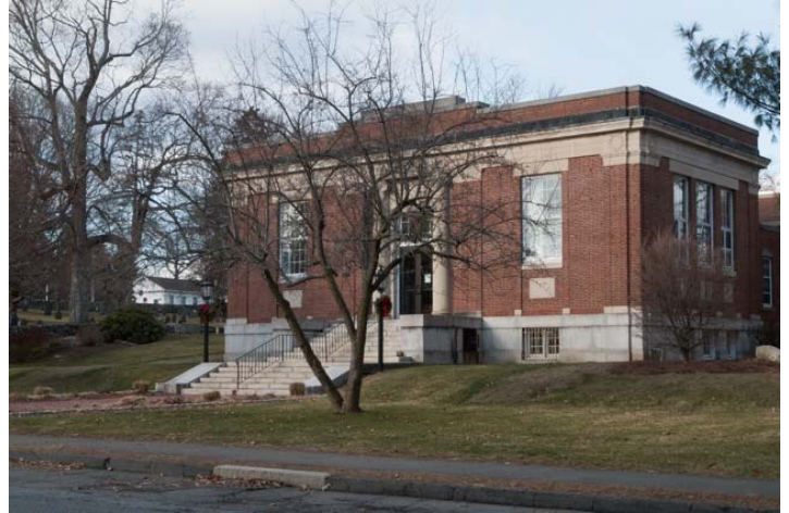
Main Street: 25 (Southborough Public Library). View NW.