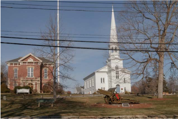
Town Common, Town House, and Second Meetinghouse, 17 and 15 Common Street. View N.