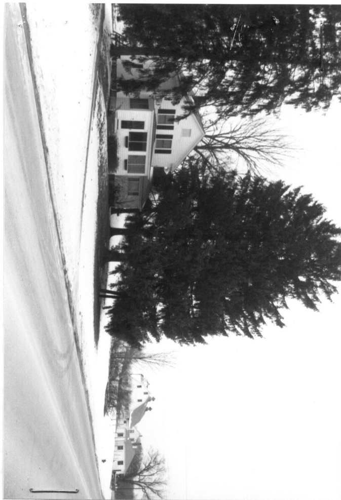
36 + 48 Fisher Road