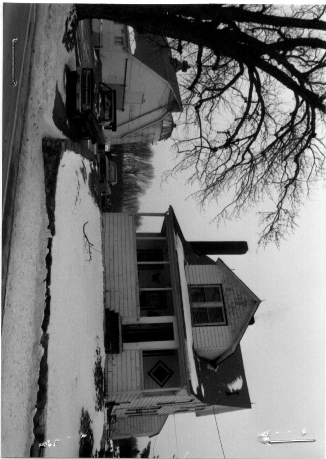
48 Fisher Road