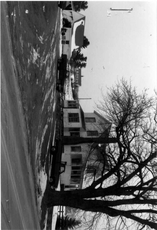
48 Fisher Road