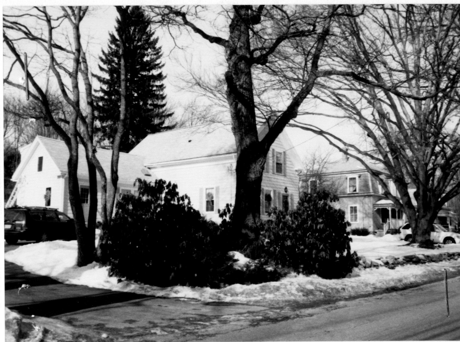
49-45 Deerfoot Rd.