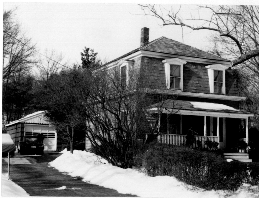
45 Deerfoot Road