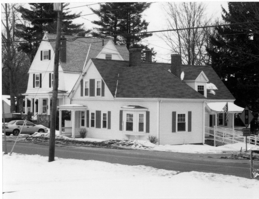
34, 36 Main St.

Town of Southborough: Vital Records; Annual Reports and Tax Valuations, various dates.