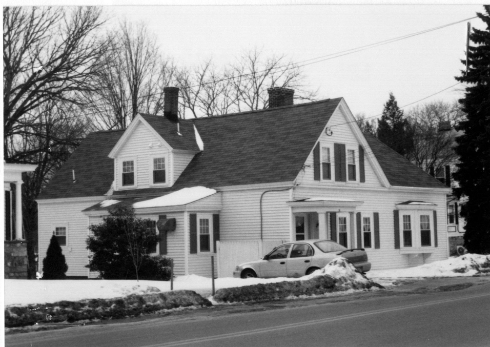
36 Main St.