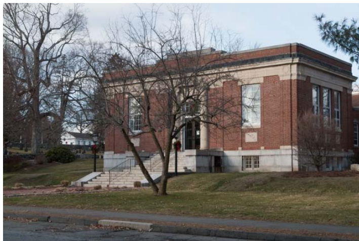
Main Street: 25 (Southborough Public Library). View NW.