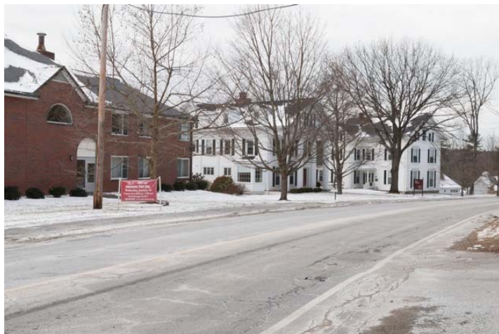
Main Street (Fay School): 50, 52, 54. View SW.