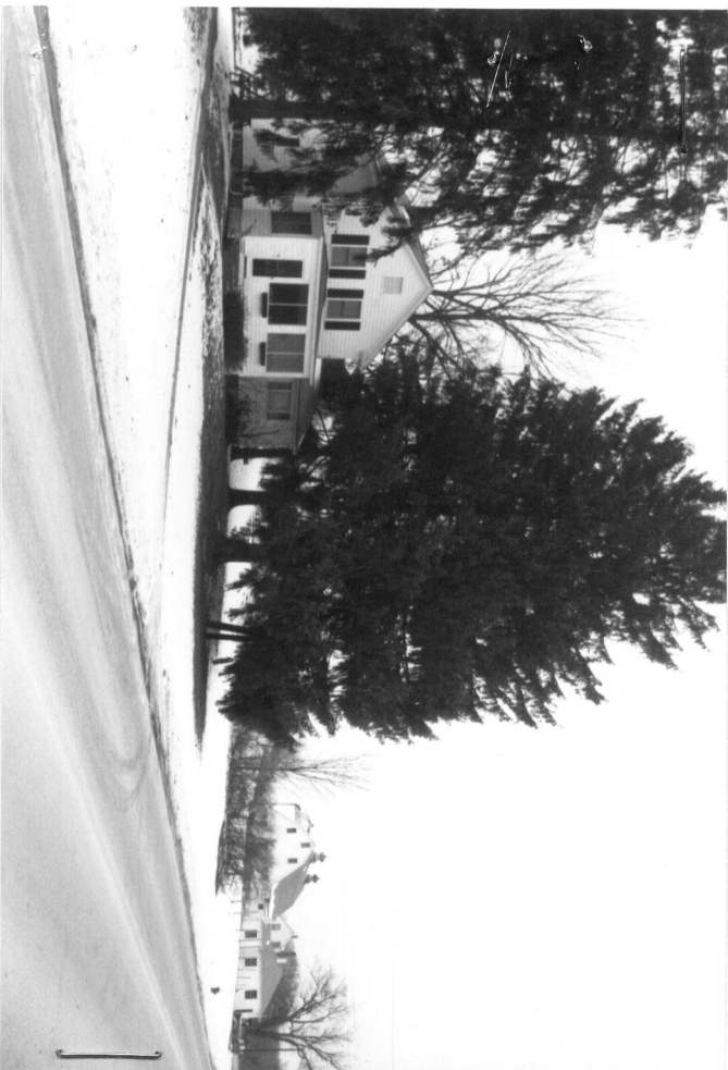
36 + 48 Fisher Road