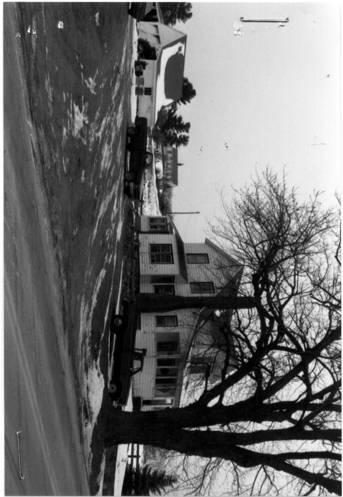
48 Fisher Road