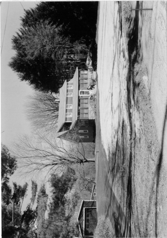
Circle and number the inventoried building. Indicate north.

MASSACHUSETTS HISTORICAL COMMISSION MASSACHUSETTS ARCHIVES BUILDING