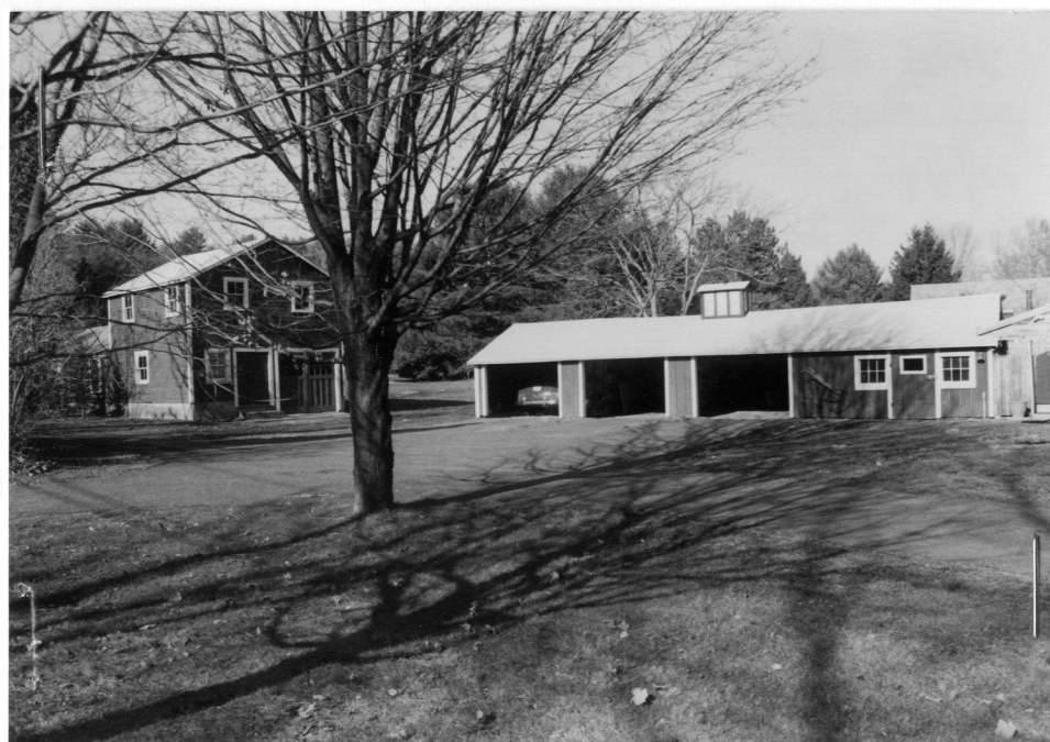
Hen house (SBR.660).