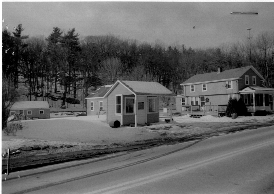
Produce stand (SBR.334)