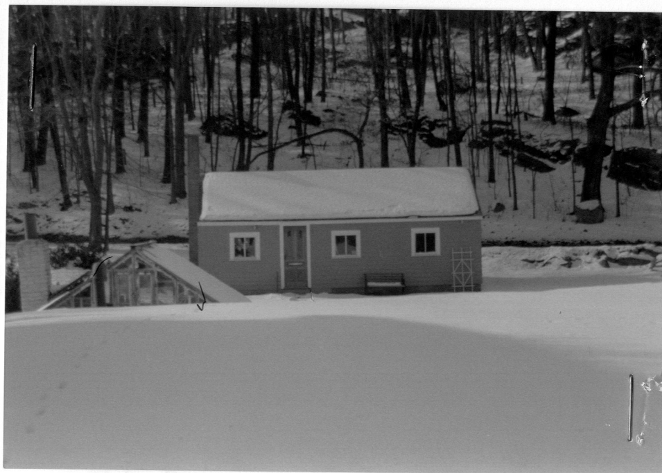
In-Ground Greenhouse (SBR.335).