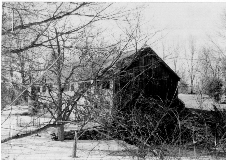
Photograph - Poultry Barn

Recommended for listing in the National Register of Historic Places. If checked, you must attach a completed National Register Criteria Statement form.