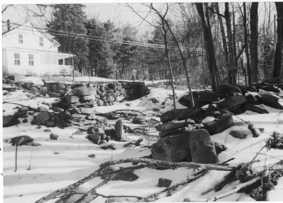
Foundation opposite 136 Middle Rd.