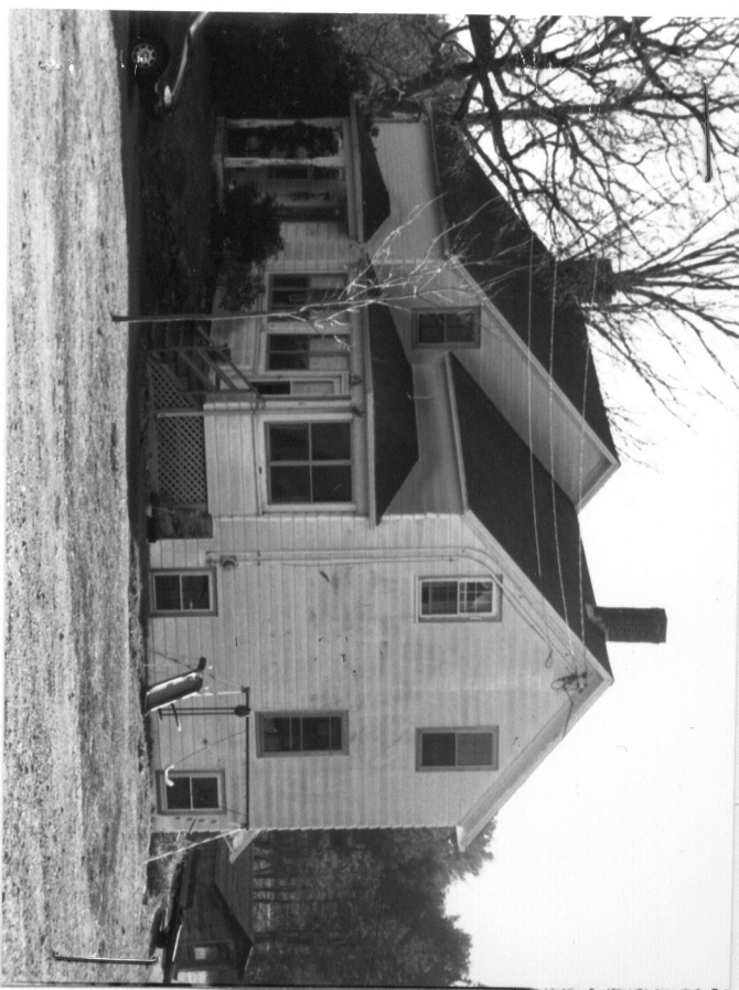
120 Northboro Rd (5BR.11).