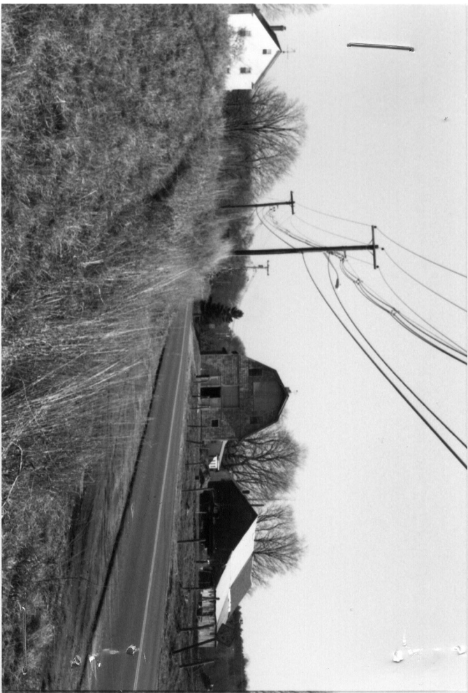
119 + 120 Northboro Rd, view east.