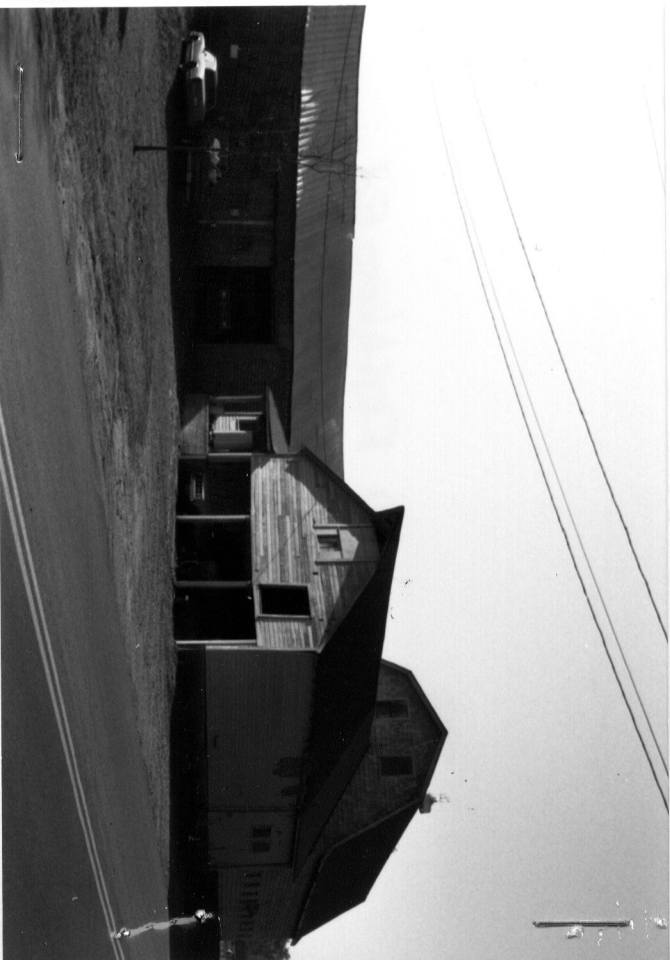
Barns-120 Northboro Rd.