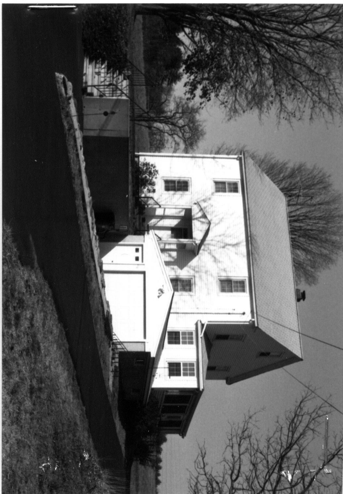
119 Northboro Rd (5BR.357).