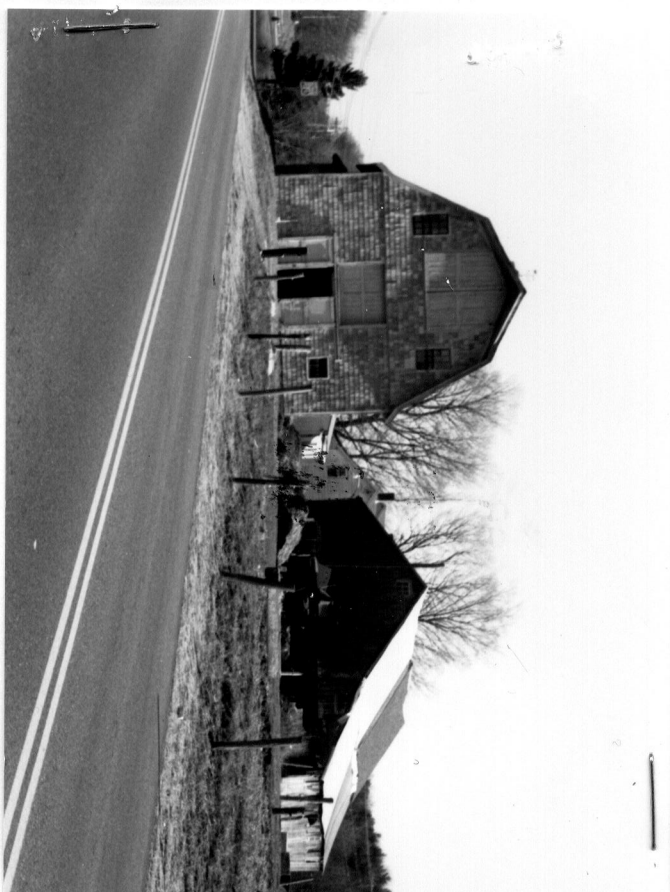
Barns-120 Northboro Rd, view east