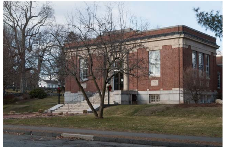
Main Street: 25 (Southborough Public Library). View NW.