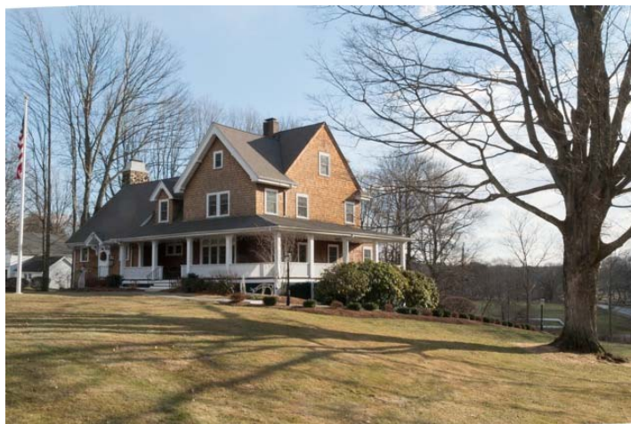
Main Street: 28 (Southborough Community House). View SE.