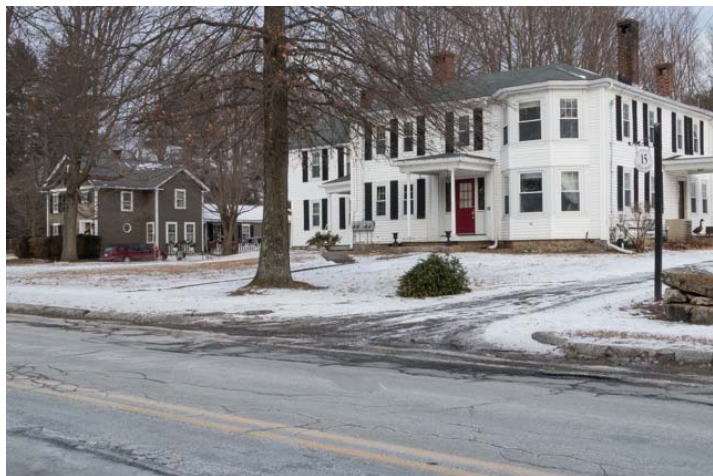
Main Street: 17 and 15. View NW.