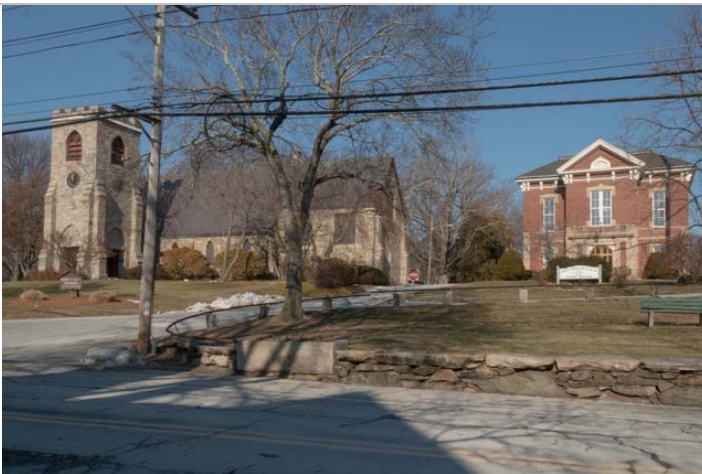
Main Street: 27-29 (St. Mark's Church) and 17 Common Street (Town House). View N.