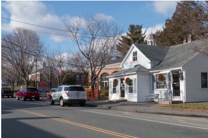
Main Street: 09, 05 (Southborough Firehouse), 03. View NW.