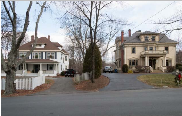
Latisquama Road: 10 and 12. View E.