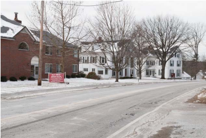
Main Street (Fay School): 50, 52, 54. View SW.