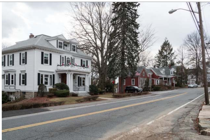
Main Street: 40 and 42. View SW.