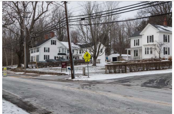
Main Street (Fay School): 33 and 31. View NW.