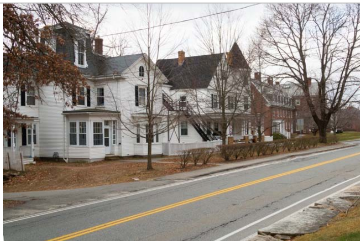
Main Street: 44, 46, 48. View SW.