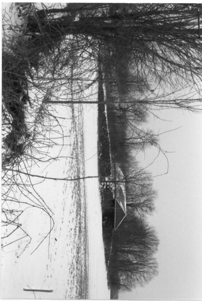
10 Chestnut Hill Rd.