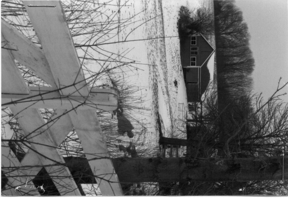
10 Chestnut Hill Rd.